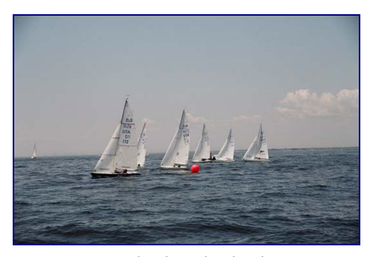
Rounding the windward mark.