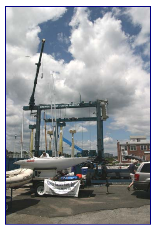
Getting ready for race day, September 2004. Brewer Yacht Haven Marina, Stamford, CT