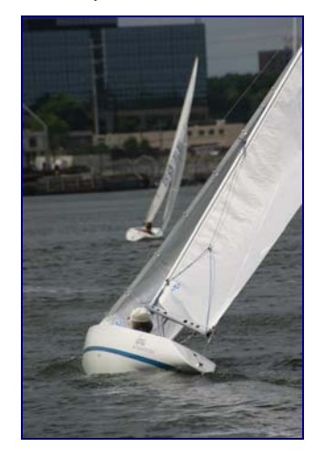
Practicing some upwind techniques.