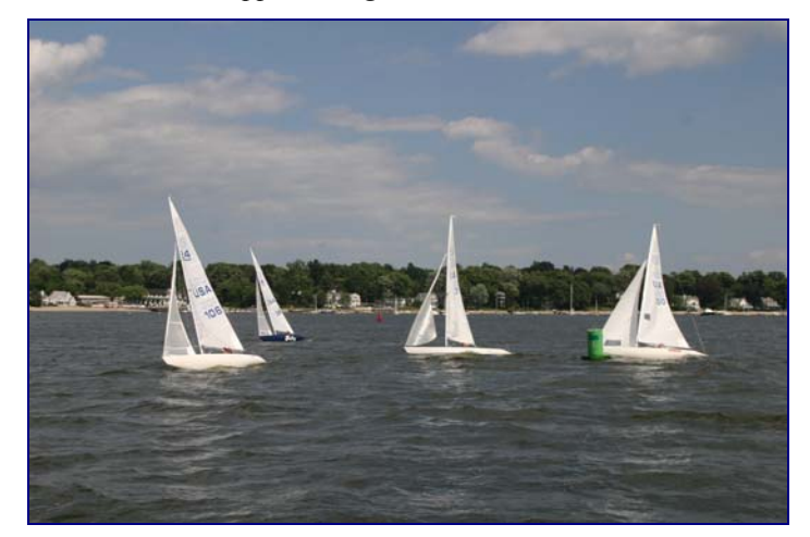
Some changes in position!