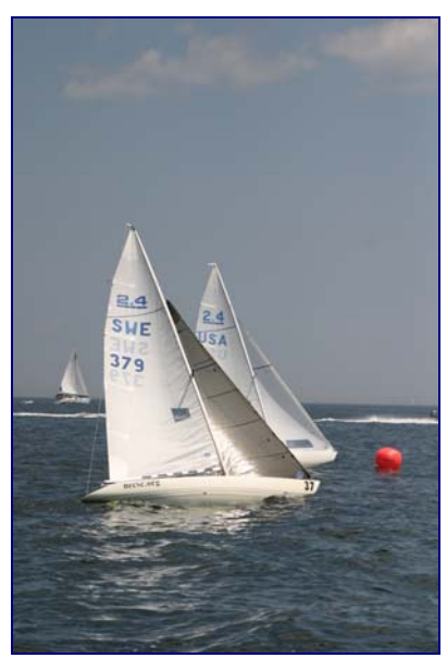
Some tight racing.