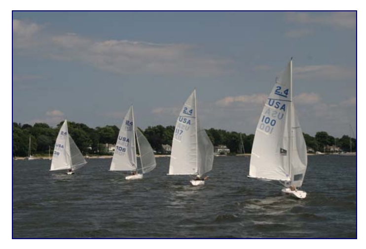
Approaching a leeward mar,.